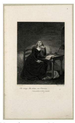
Marie-Antoinette à la Conciergerie : "elle coupa elle-même ses cheveux" Lefèvre, 18ème, Château de Versailles