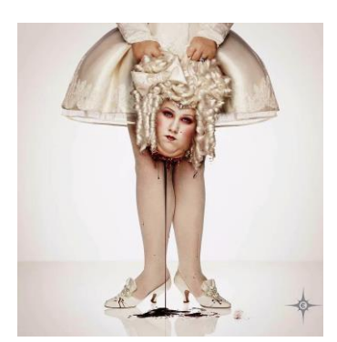
Royal Blood, Marie-Antoinette, † 1793, 2000, Erwin Olaf © Erwin Olaf