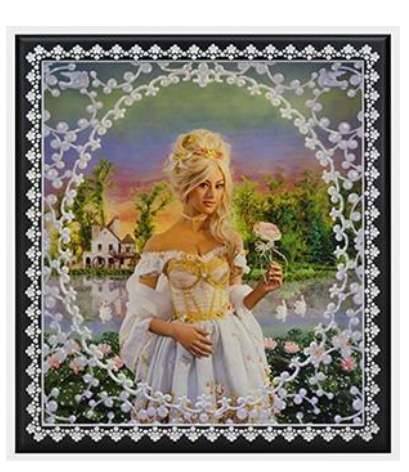
Marie-Antoinette : Le hameau de la Reine, Pierre et Gilles, 2014