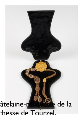
Châtelaine-residence de la duchesse de Tourzel, collection privée