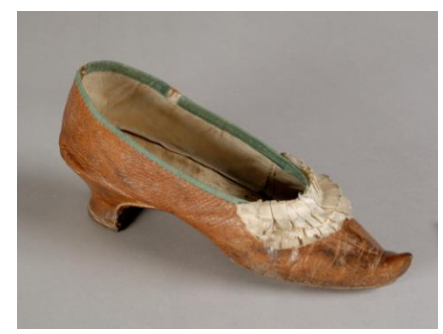
Soulier Musée des Beaux-Arts de Caen, © cliché Patricia Touzard