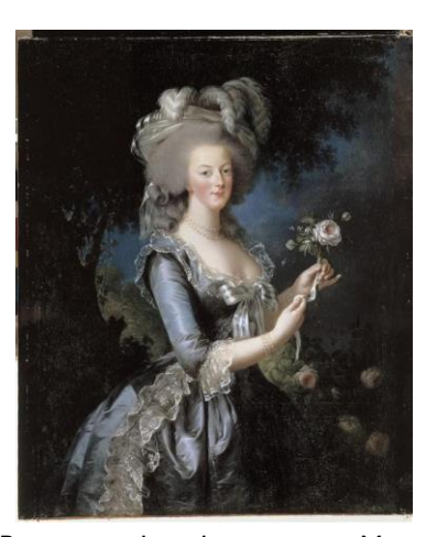
Portrait de la reine Marie-Antoinette dit « à la rose », Élisabeth-Louise Vigée-Lebrun, 1783, Château de Versailles