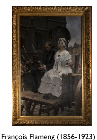
Marie-Antoinette se rendant au supplice 1885. Musée de la Révolution française. Dépôt des musées de Senlis.