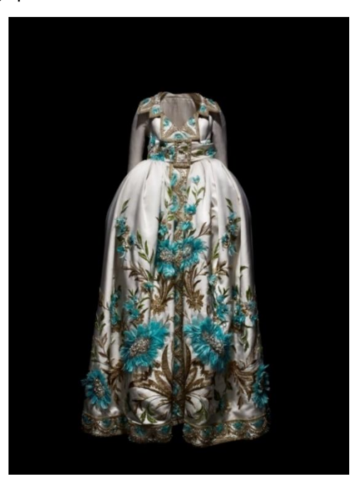
Robe – manteau, Passage 3, Printemps Eté 2005 John Galliano, Dior » (no permission to retouch or modiy the image)