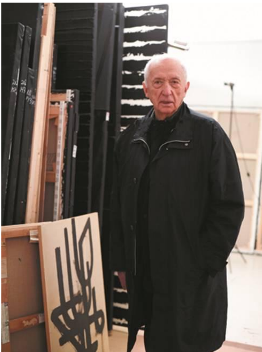
Pierre Soulages, 2011