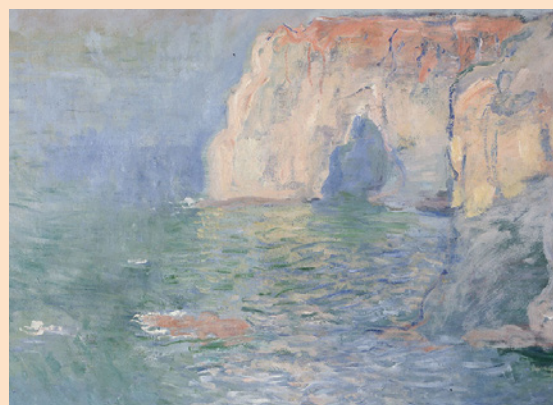
Poster of the 2022 edition of the festival, photograph by Paul Rousteau. Claude Monet, The Manneporte (Étretat), 1885, musée des Beaux-Arts de Caen.

The festival will include a number of major exhibitions throughout its duration and will also be marked by key moments, highlighting other disciplines (dance, music, theatre, opera, cinema, circus...).