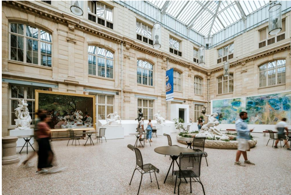
Musée des Beaux-Arts de Rouen

As part of the Normandy Impressionist Festival , the Musée des Beaux-Arts de Rouen presents an exhibition entitled “David Hockney Normandism”, dedicated to the British painter David Hockney. Hanging amid a sumptuous collection of Blanche and Renoir, 10 paintings by David Hockney open the doors of his studio. Recent landscapes painted in Normandy, where he has been living and working since 2019, dialogue with those of Claude Monet hanging opposite.