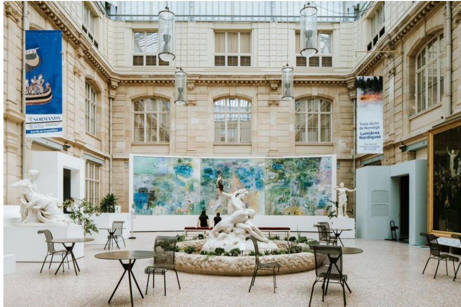
Musée des Beaux-Arts de Rouen

As part of the Normandy Impressionist Festival , the Musée des Beaux-Arts de Rouen presents an exceptional exhibition entitled “ Whistler, the Butterfly Effect ”, dedicated to the American painter James Abbott McNeill Whistler. Visitors will be able to immerse themselves in a major artistic phenomenon: Whistlerism . Throughout Europe and the United States, the growing production of nocturnal landscapes and portraits attests to the widespread dissemination of the artist's plastic research. To contrast his signature style, his works will be exhibited along with major works from his Impressionist contemporaries.