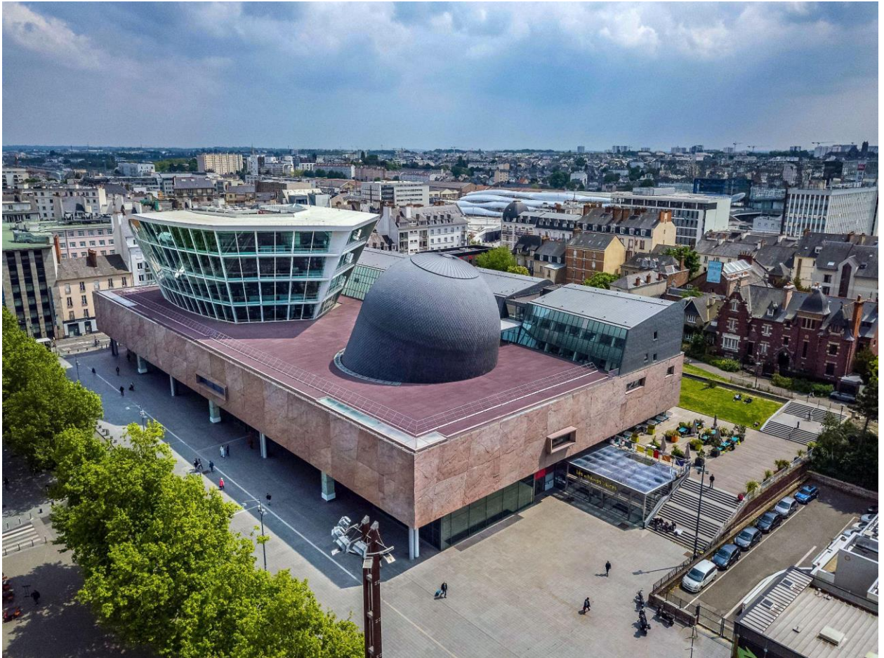
Musée de Bretagne - Champs Libres crédit photo : A.Duquesnel, CC-BY-NC-SA – 2019

To celebrate the Paris 2024 Olympic Games , the Musée de Bretagne has chosen to showcase its sports-related photographic collections. The presentation of the photographs is designed as a crescendo, starting with the frozen image from the beginning of the century that symbolizes the first links between sport and photography, to the festive popular event represented by the Coupe de France victories by FC Nantes in 1971 and 2019.