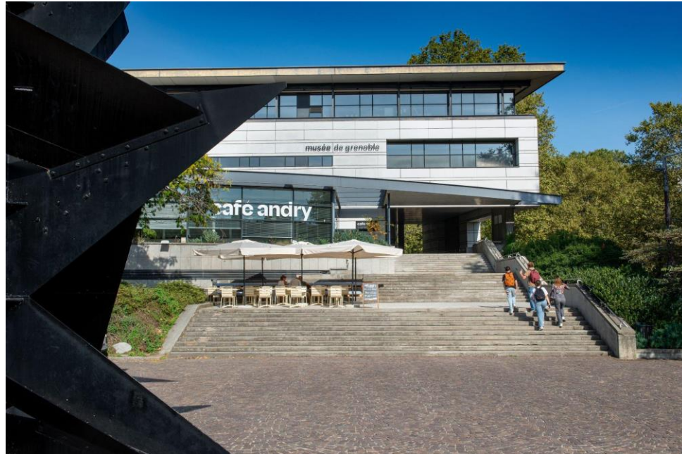
Vue musée de Grenoble

The Musée de Grenoble, in partnership with the Centre Pompidou , presents an exhibition on Joan Miró , featuring over 130 works. Among these loans, three “ Bleu ” works will be exceptionally exhibited in Grenoble. The exhibition will highlight Miró's iconoclasm, creative energy and artistic modernity, spanning his entire career with a particular focus on works from the 1960s-70s, a period marked by inner exile and intense artistic experimentation.