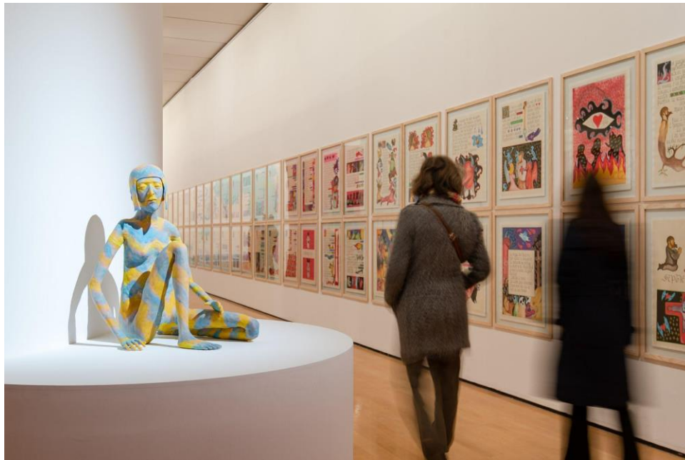
Vue de l'exposition Friends in Love and War - L'Éloge des meilleur-es ennemi-es au Mac LYON du 8 mars au 7 juillet 2024. Œuvres : Francis Upritchard, Marianne, 2016. British Council Collection + Fabien Verschaere, Seven Days Hotel, 2007. Collection macLYON © Adagp, Paris, 2024