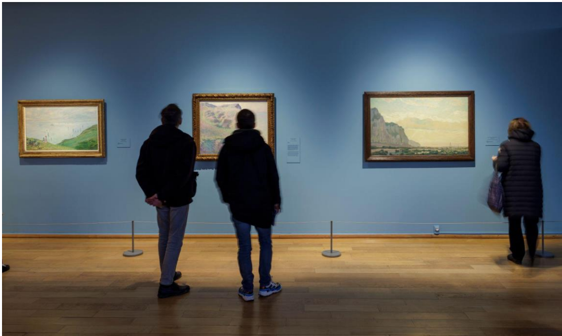
Musée des Impressionnismes de Giverny

The Musée des Impressionnismes in Giverny is contributing to the Normandy Impressionist Festival by highlighting the Impressionist movement and its close ties with the Normandy region. In this exhibition, famous masterpieces such as La Vague de Courbet (1870, Orléans, Musée des Beaux-Arts) and Manet's L'Évasion de Rochefort (1881, Paris, Musée d'Orsay), converse with lesser-known works, creating a fruitful exchange between paintings, drawings and prints.