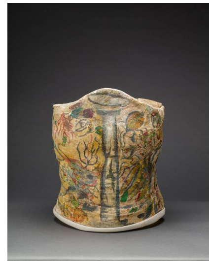
Hand-painted medical corset.

Frida Kahlo underwent dozens of operations in an attempt to alleviate her serious health problems and pain. She was sometimes forced to wear corsets and other medical devices, which she decorated and transformed into works of art. In shaping the image of her disabled body, Frida Kahlo played a pioneering role. She built a visual vocabulary with which she expressed physical and emotional suffering, while at the same time describing her own resilience and ability to create meaning, joy, beauty and art.