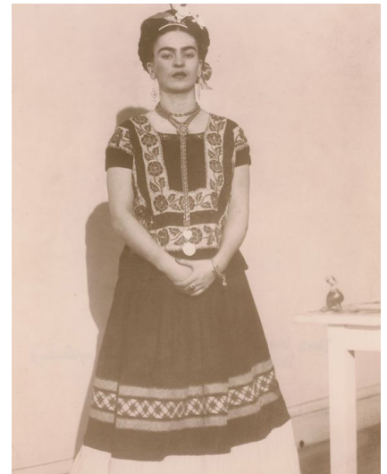
Frida Kahlo in Paris by Dora Maar, 1934.