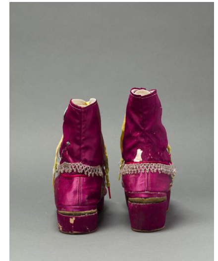
Pair of boots.