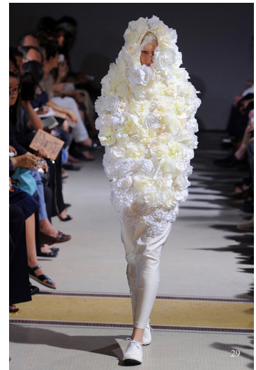
Comme des Garçons ensemble, Spring-Summer 2012, «White Drama» collection. Palais Galliera collection, Paris.