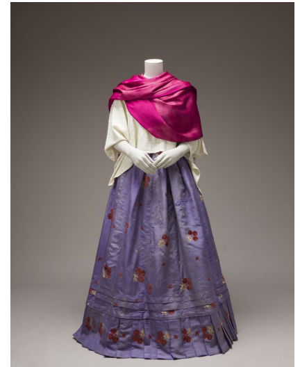
Shawl, huipil and skirt.

Her experiences in the United States (1930-1933) were both complex and decisive. In San Francisco, photographed by leading photographers, she developed her distinctive Tehuana style and began to paint more seriously. In Detroit, a traumatic miscarriage radically transformed her art, leading her to reinvent herself as a painter and to shatter taboos. In 1938, she triumphantly returned to New York as a full-fledged artist, with her first solo exhibition at the Julien Levy Gallery.