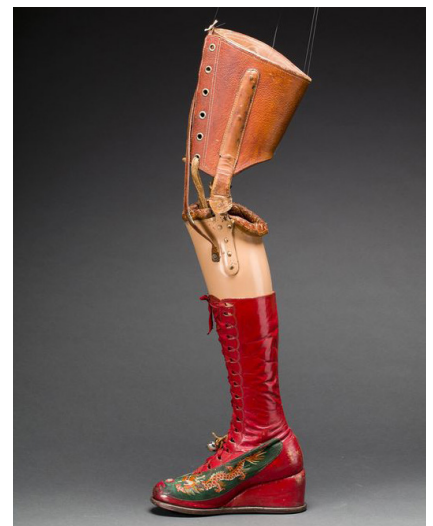
Leg prosthesis.

As a teenager, Frida dressed in unconventional ways to express her personality and to hide her leg, which was damaged by polio. By the age of 20, she adopted traditional Mexican dress, which she wore throughout her life. Although she created a unique hybrid style, blending elements from different regions and eras, she identified particularly with the women and her matriarchal culture of Tehuantepec. She adopted their embroidered blouses, long skirts, elaborate hairstyles and rebozos (woven shawls) in a fascinating personal interpretation of mexicanidad (Mexicanness).