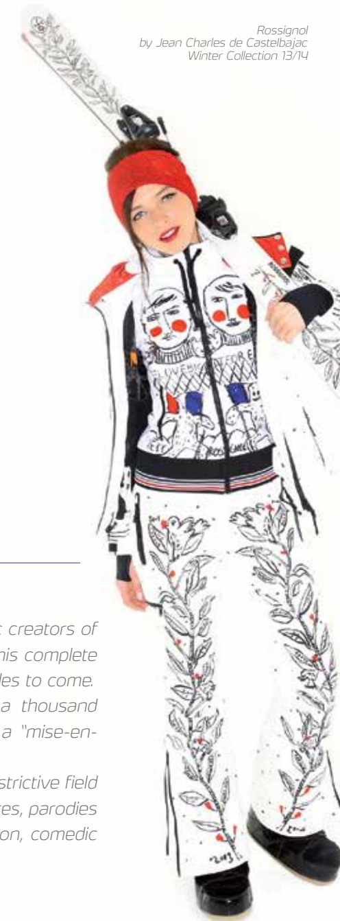
Rossignol by Jean Charles de Castelbajac Winter Collection 13/14