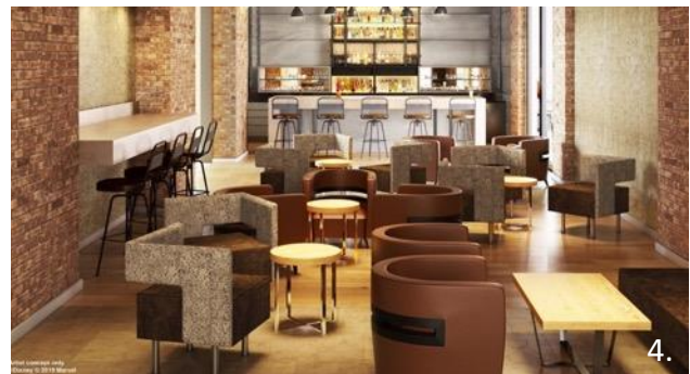
1. Manhattan Restaurant , 2. Downtown Restaurant, 3. Skyline Bar, 4. Bleecker Street Lounge.